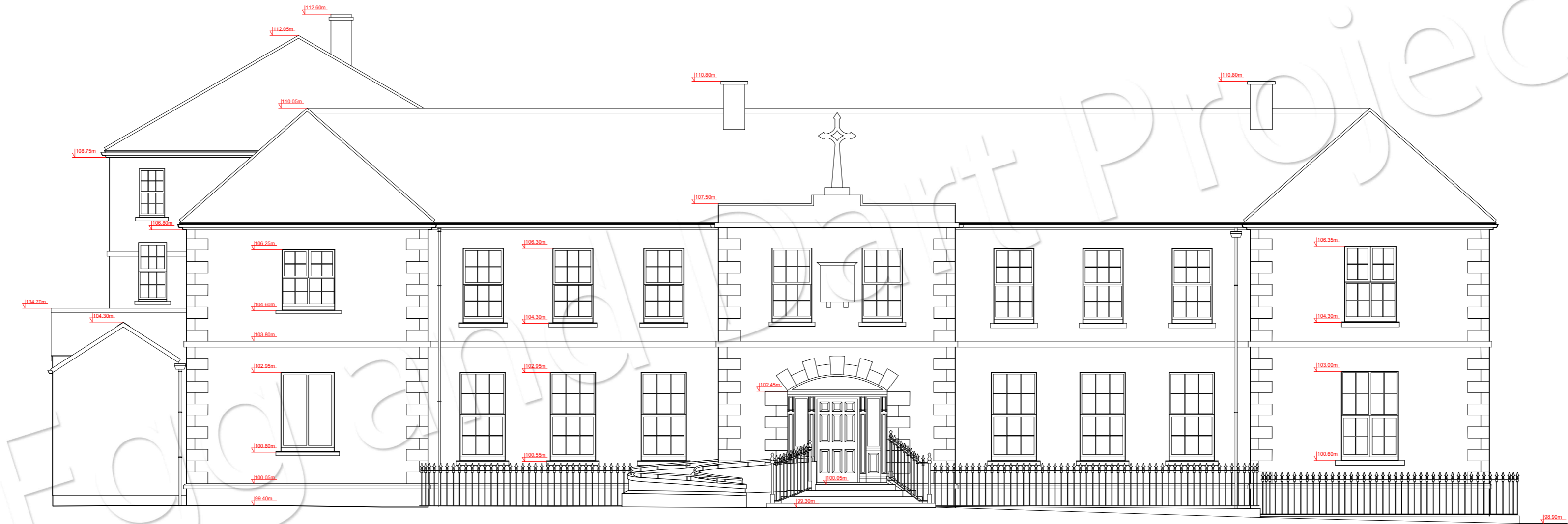
FRONT ELEVATION SCALE: 1:100